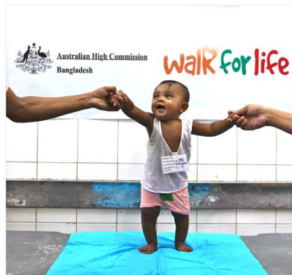
AFTER - 14 September